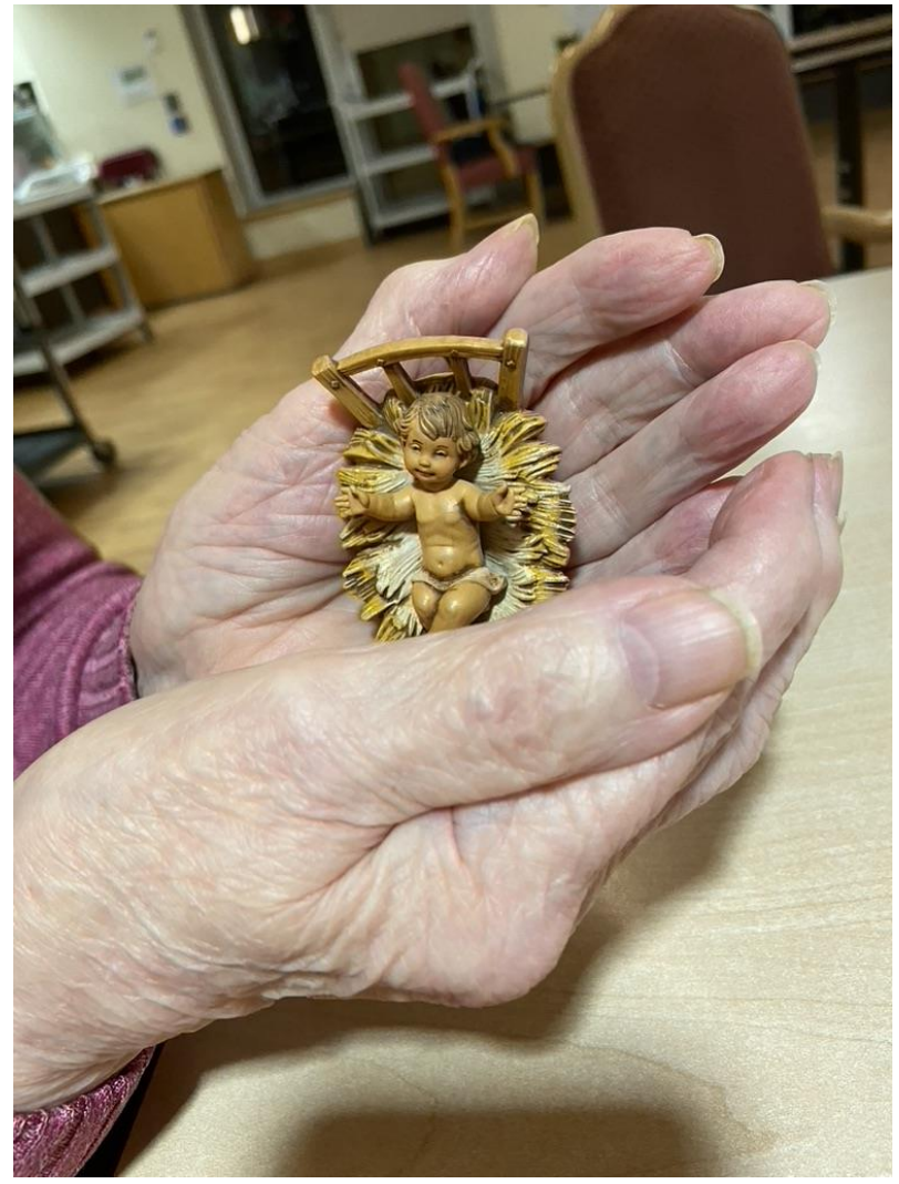
A woman in a nursing home holds baby Jesus as the nativity story is told. "Gosh, he's cute"

And so we pray, "Wherever the world is in darkness, Lord. Let there be light."