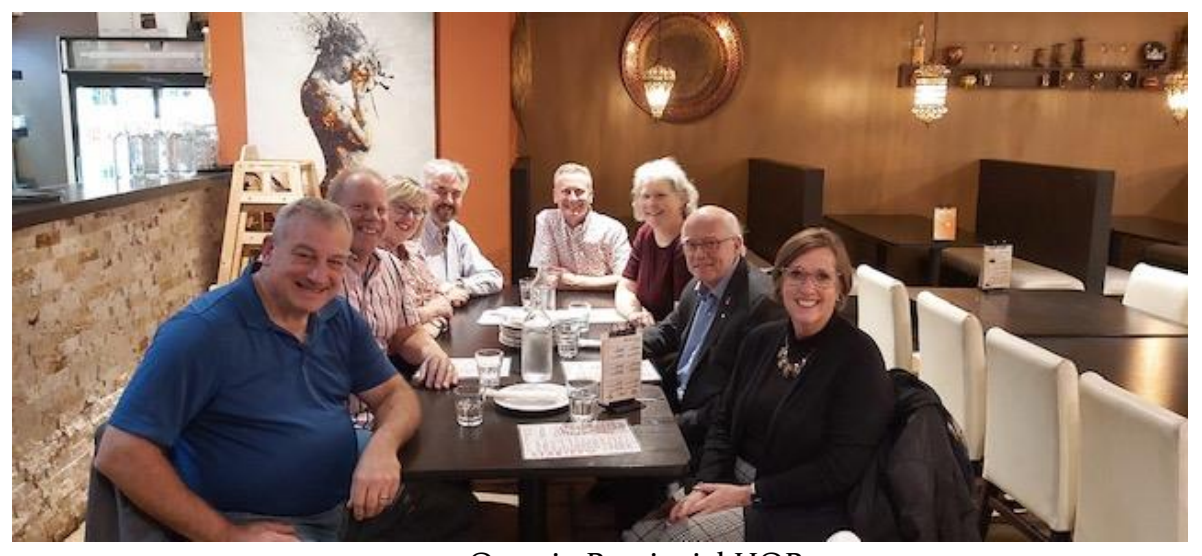
Ontario Provincial HOB