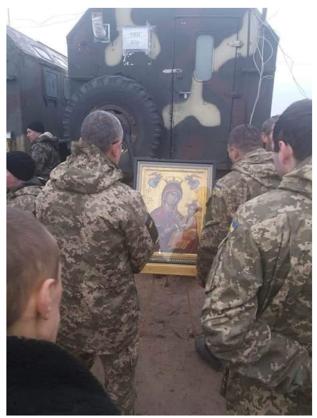
Ukrainian soldiers pray in front of an Icon of the Blessed Virgin Mary

"Hide your face from my sins; wipe away all my guilty deeds! Create a clean heart for me, God; put a new, faithful spirit deep inside me! Please don't throw me out of your presence; please don't take your holy spirit away from me. Return the joy of your salvation to me and sustain me with a willing spirit."