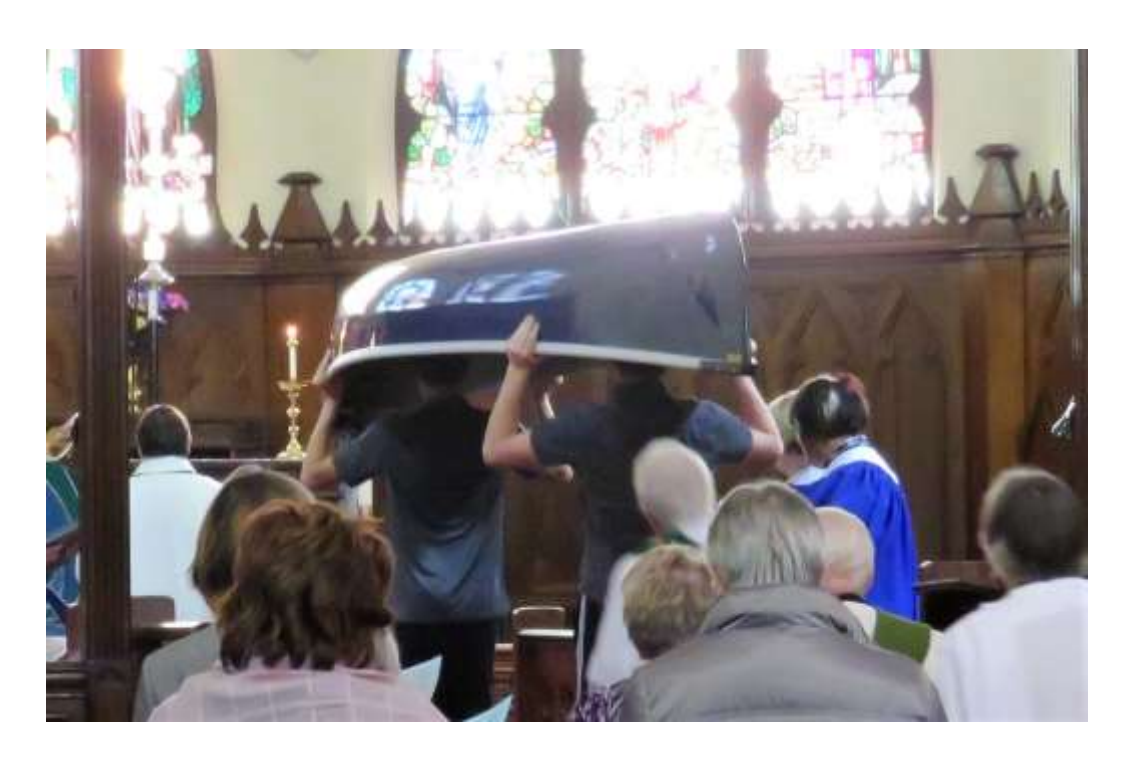
"Working together with others we know that a boat moves forward when all row together."